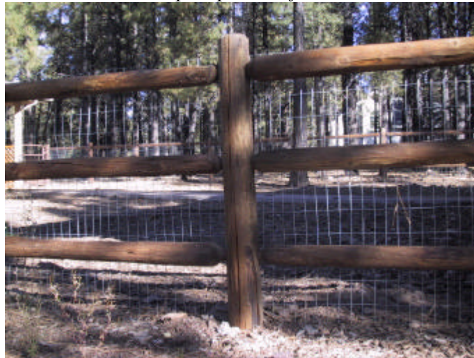
Sample split rail fence with interior fastened metal mesh.