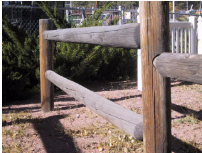
Sample split rail fence.

1. Wooden Split Rail Fencing: The classic look of natural split rail fencing is ideal for perimeter fencing and decorative fencing purposes. Only unpainted, treated wooden split rail is allowed. An unpainted metal mesh may be affixed to the interior portion of the fence to assist in containing animals. Split rail fencing must not be painted. This type of fence may be used on all sides of the Primary Dwelling.